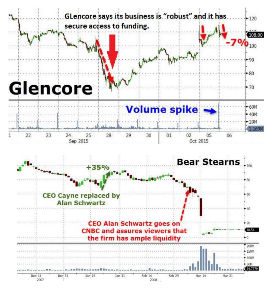
Stay tuned, things could get out of control fast!!